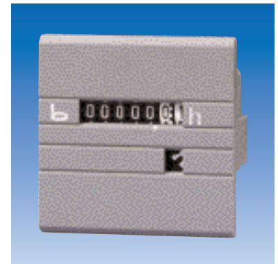
type 631, 631.1, 633, 633.1, 629, 629.1, 637, 637.1