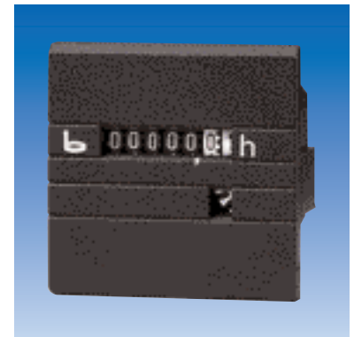
type 632, 632.1, 634, 634.1, 630, 630.1, 638, 638.1

Front frame 48 x 48 mm, cutout \square 45,2 \pm 0,3 mm