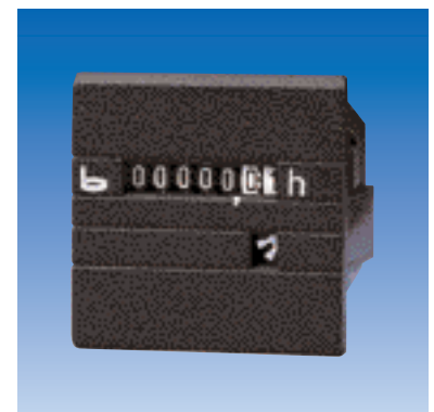
type 632.2, 632.3, 634.2, 634.3, 630.2, 630.3, 638.2, 638.3