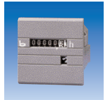
type 631.2, 631.3, 633.2, 633.3, 629.2, 629.3, 637.2, 637.3